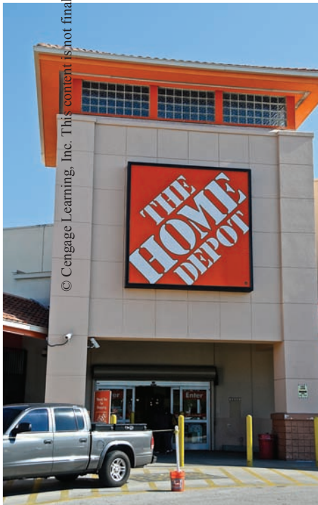
The Home Depot is the largest home improvement chain in the world with approximately 2,250 stores in the United States, Puerto Rico, Canada, Mexico, and China.

© Cengage Learning, Inc. This content is not final and may not match the published product.