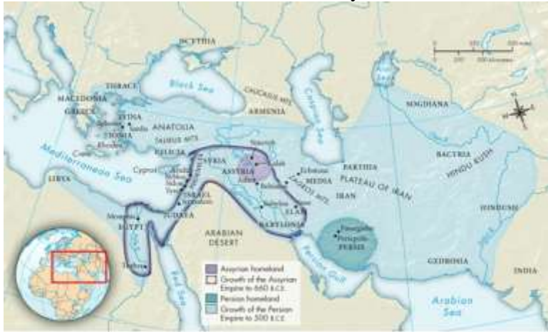
McKay, A History of Western Society, 12e